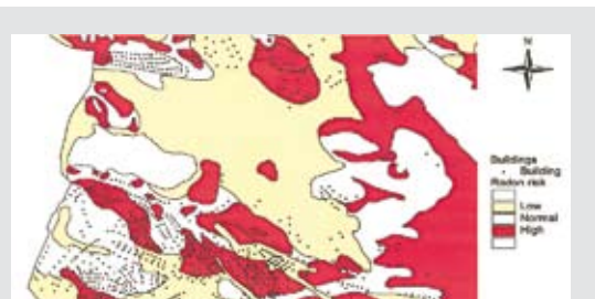
Radon Risk Map