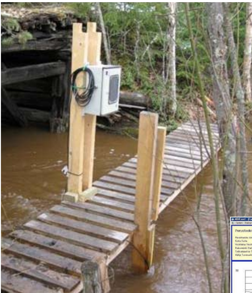
Continuous Monitoring of flow, pH and suspended material.